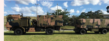
Land 121 3B & 5B Rheinmetall