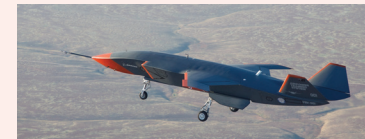
Boeing Loyal Wingman Program