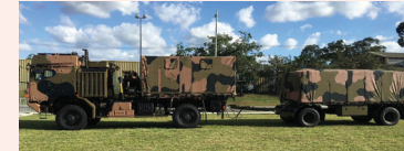
Land 121 3B & 5B Rheinmetall